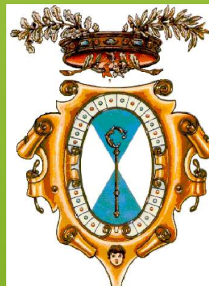
Provincia di Bari